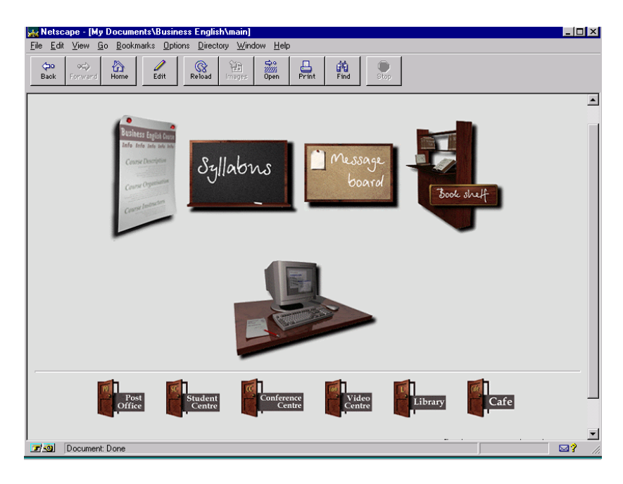
Figure 2. The Interface of the Business English Course